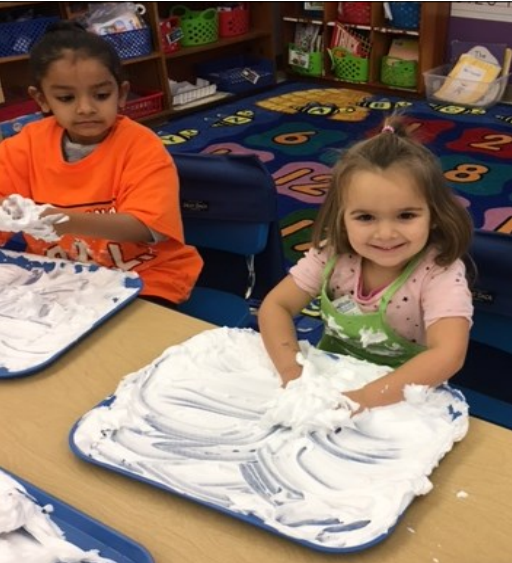
PEAK Program: Pre-school students are using shaving cream to learn about letters as part of the newly expanded full day PEAK program. They also have art, physical education, library/technology.